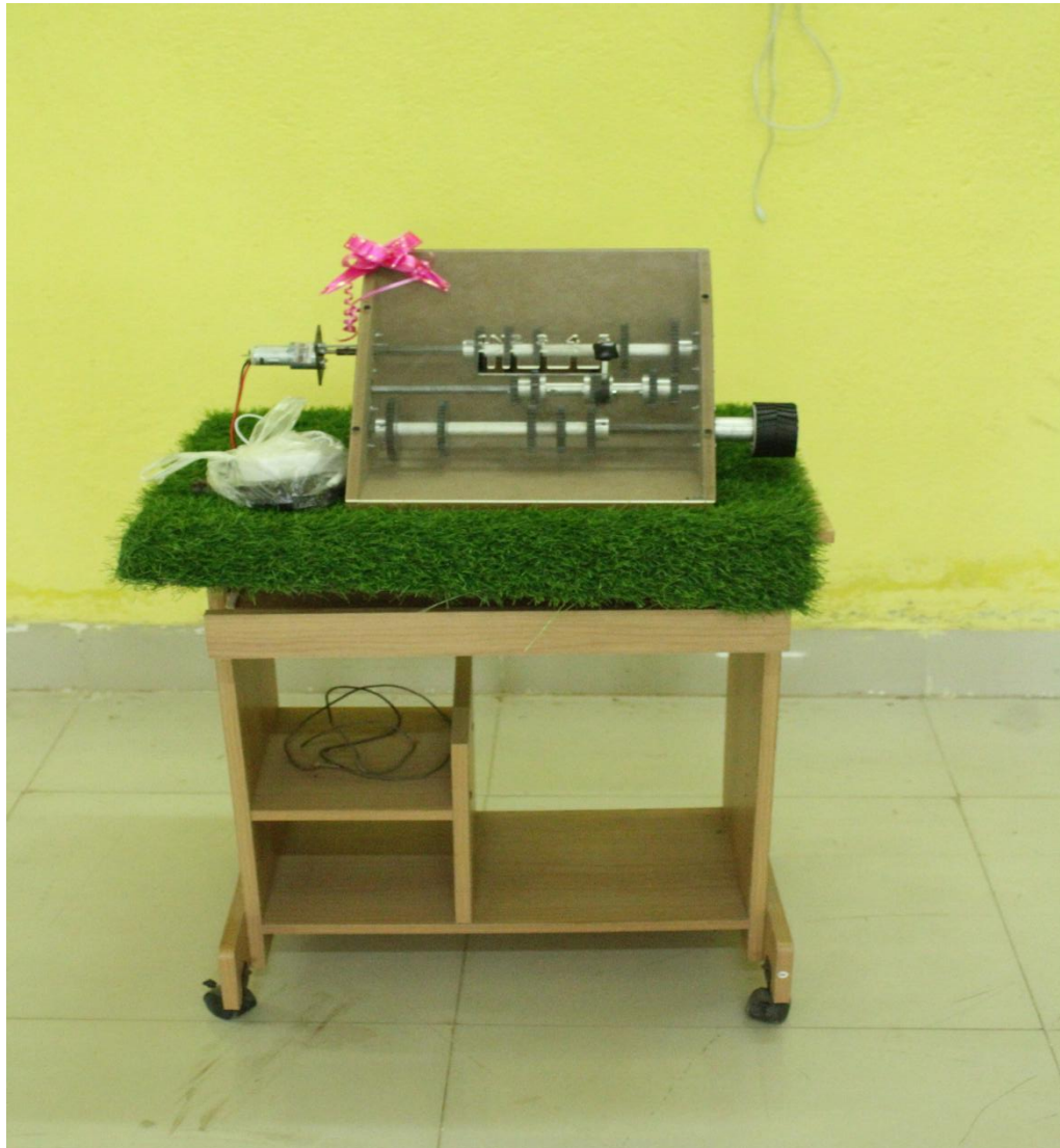
5 SPEED GEAR BOX MECHANISM BATCH 2022-25 GROUP 2(AY 2024-25)