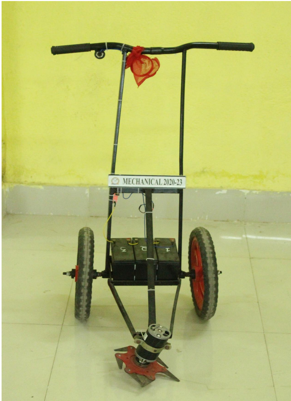
BATTERY OPERATED GRASS CUTTER BATCH 2020-23 GROUP-1(AY- 2022-23)