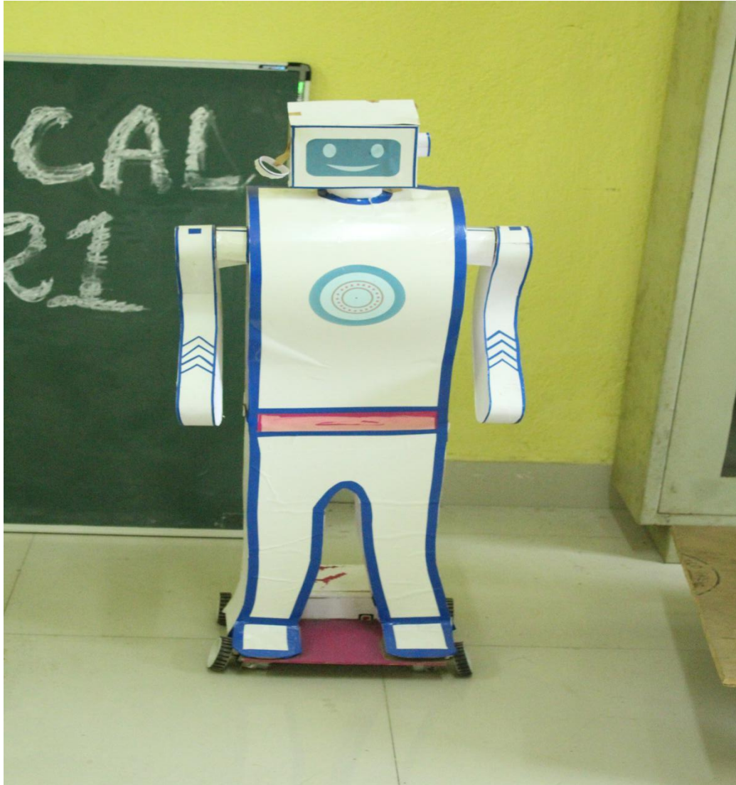
WALKING ROBOT BATCH 2021-24 GROUP 2(AY- 2023-24)