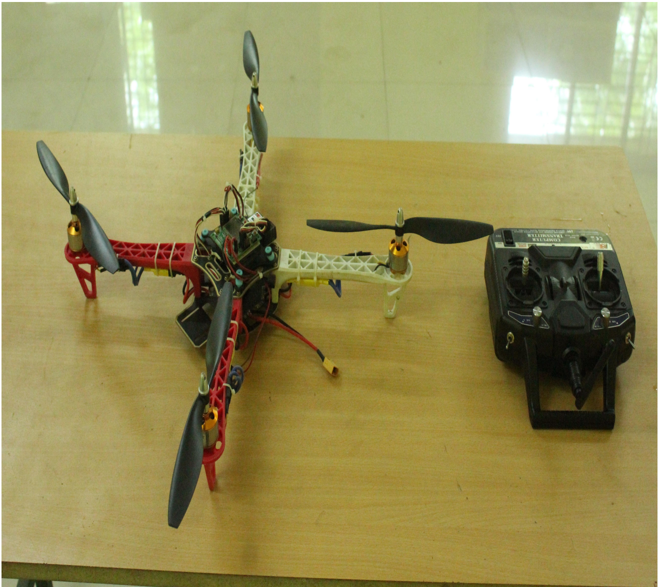
QUADCOPTER DRONE BATCH 2020-23 GROUP-2(AY- 2022-23)